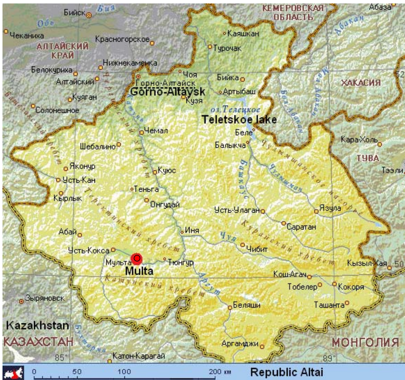
Fig. 2. Map of the Altai Republic.

«Lakes Multinskie» with following excursion to a cascade system of the three beautiful mountain lakes located 2000 m above sea level. A boat trip, visiting Nikolai Rerikh and “old orthodox believers” Museums, waterfall Kuyguk excursions and other sightseeing are also considered during the trip (the exact route will be specified in the third information letter). Overnight stay will be in the wooden houses with stove heating. The return will be also by bus to the Barnaul City.